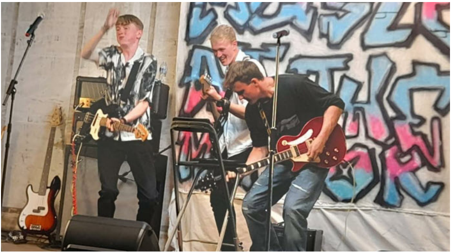
Music at the Manor 2023