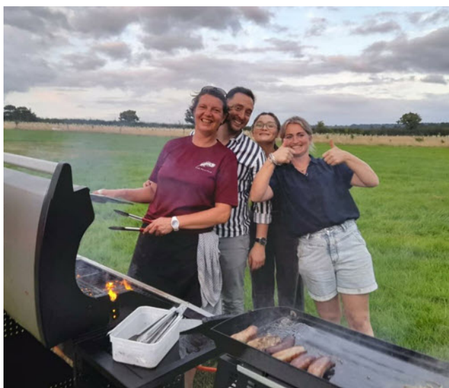
Music at the Manor 2023

Nicodemus operates in many English and Spanish-speaking countries including the UK and Latin America where we are working with over 200 projects. The charity works alongside churches and community groups to train people to be mentors who support young people to overcome their difficulties.