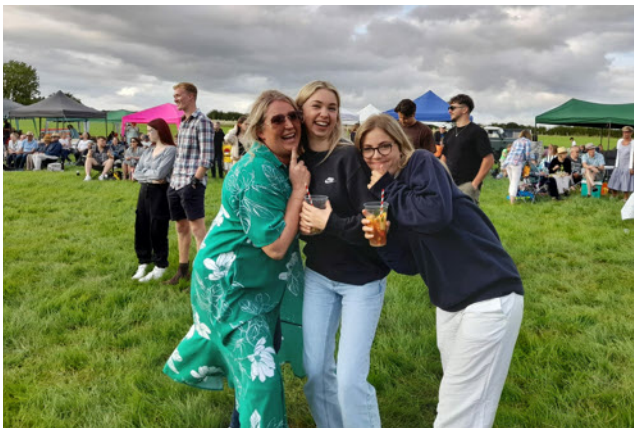
Music at the Manor 2023

The date of this year's Music at the Manor is Saturday August 10th . There will be a lot going on. We have 13 bands performing this year and like last year the festival is a real opportunity for young people to gain confidence to perform in front of an audience.