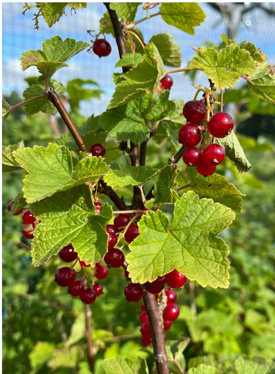
Delicious ripe redcurrants from the Wot2Grow Community Orchard.